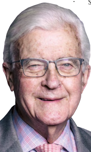
Lord Kenneth Baker