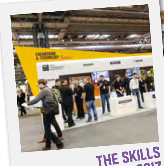
THE SKILLS SHOW 2017