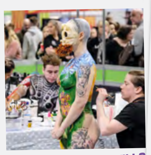
THE SKILLS לוחכ אוחום