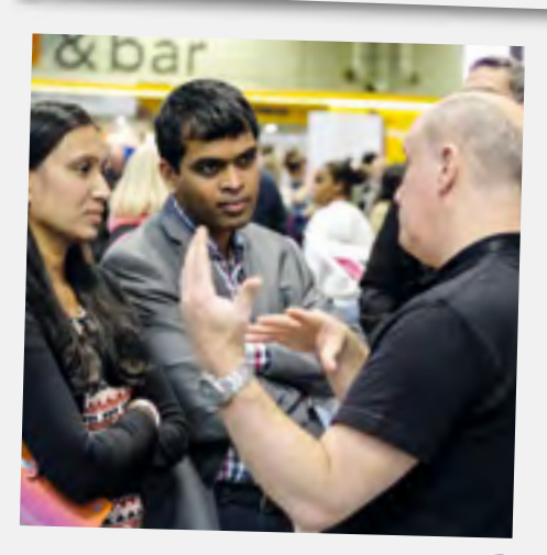
THE SKILLS SHOW 2017