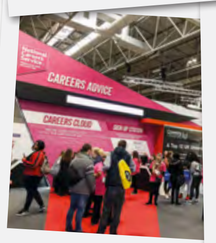
THE SKIL SHOW 20