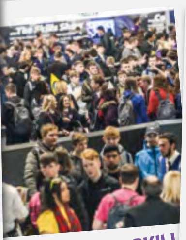
THE SKILL SHOW 20