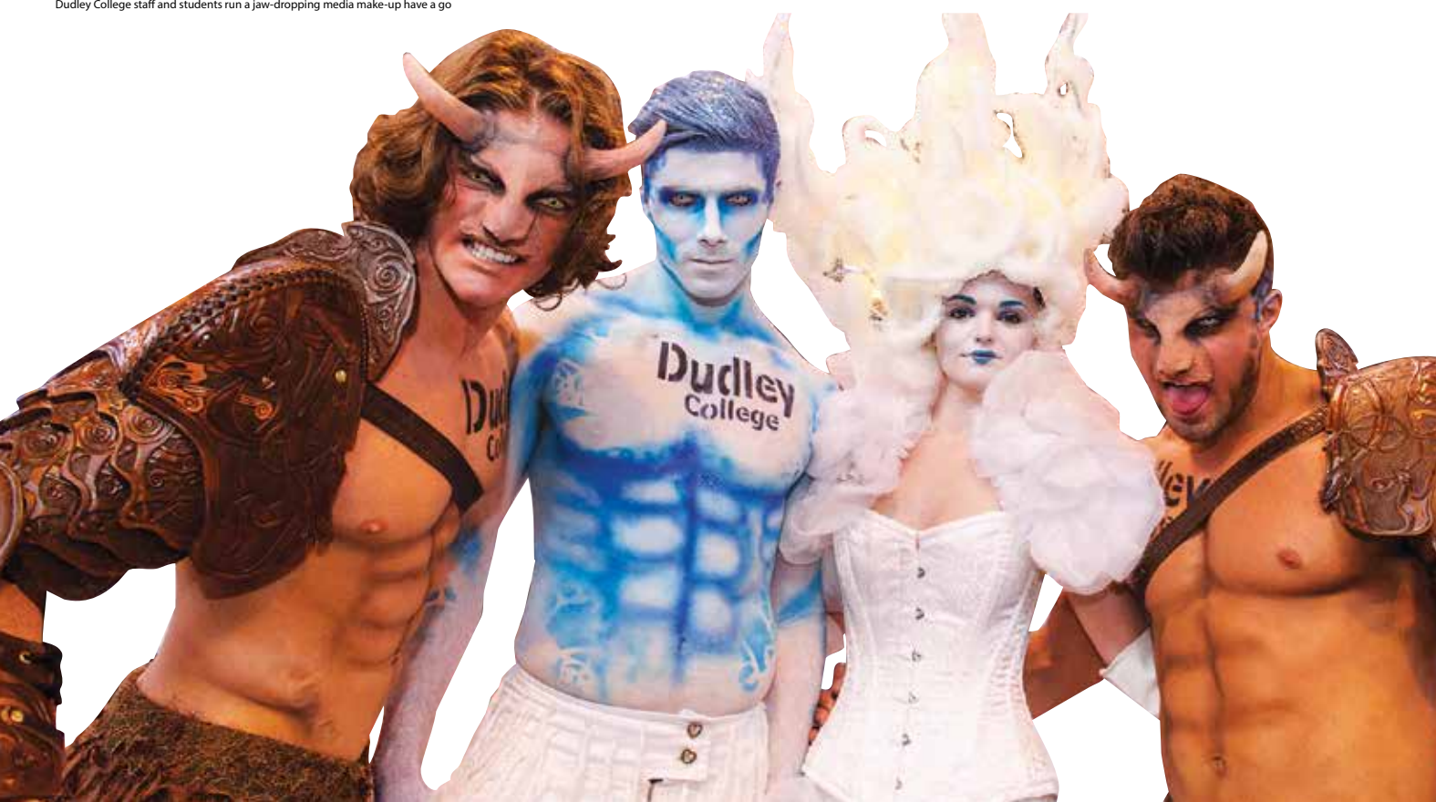
Dudley College staff and students run a jaw-dropping media make-up have a go