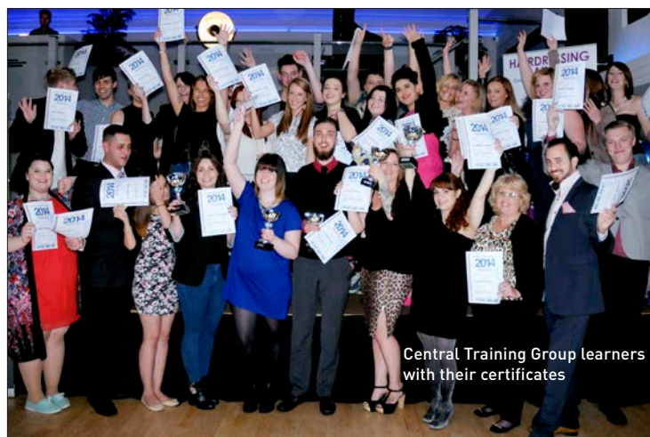
Central Training Group learners with their certificates