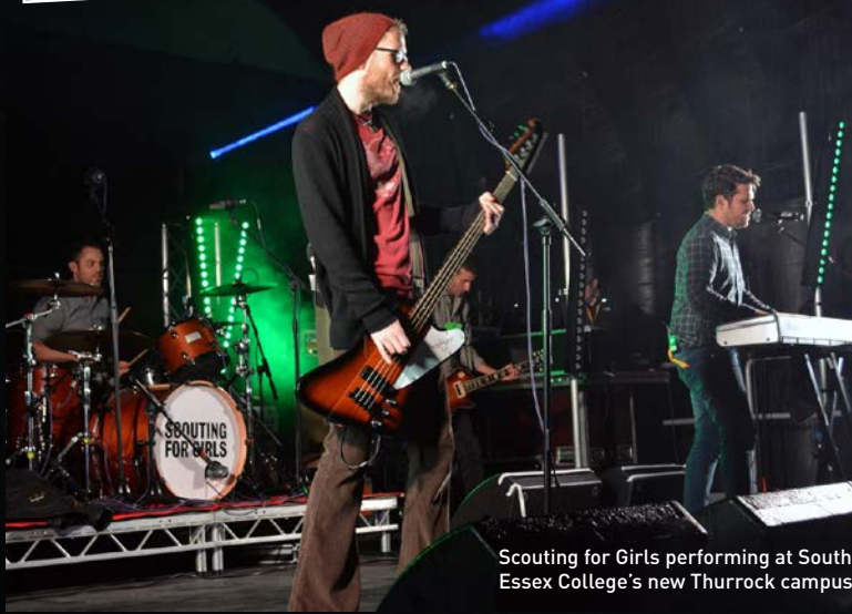
Scouting for Girls performing at South Essex College's new Thurrock campus